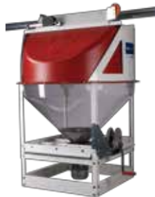
Roof mounted winchable